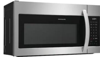
Frigidaire Microwave 1.8 Cu.Ft. Over-The-Range Microwave Stainless Steel