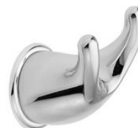
Mason Chrome Double Robe Hook