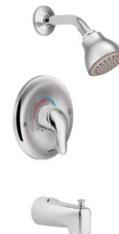
Secondary bath and Shower Valve Moen Chateau Chrome