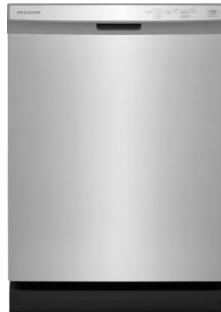
Frigidaire Dishwasher 24" Built-In – Stainless Steel