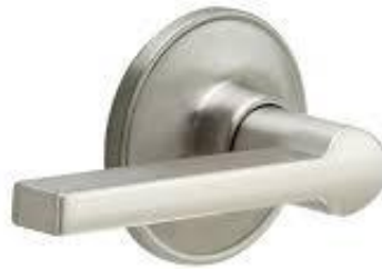
Schlage Solstice Lever Finish: Satin Nickel