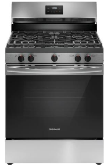
Frigidaire 30" Range Stainless Steel