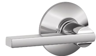
Schlage Solstice Lever Finish: Chrome