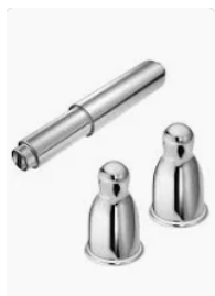
Moen Mason Chrome Toilet Paper Holder