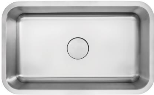
Stainless Steel Undermount Single Bowl