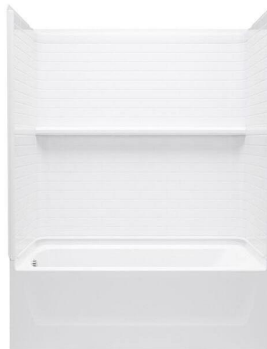
Sterling Traverse Vikrell Enclosure with tile surround look With Shower Rod