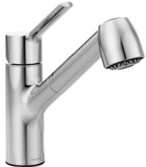
Moen Method Chrome