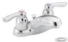
All Faucets Moen Chateau Chrome Two-Handle