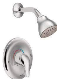
Owner's Shower Valve Moen Chateau Chrome