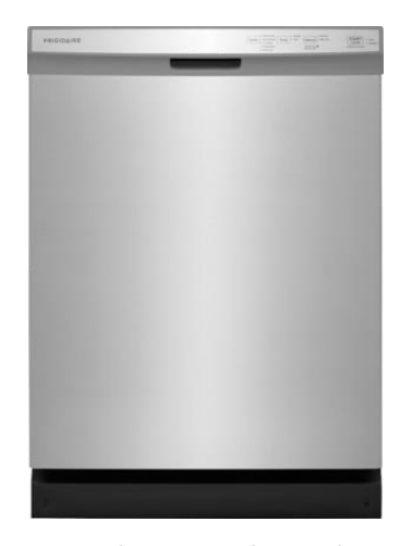
Frigidaire Dishwasher 24" Built-In – Stainless Steel