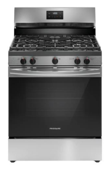
Frigidaire 30" Range Stainless Steel

Frigidaire Dishwasher 24" Built-In – Stainless Steel