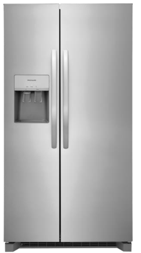
Frigidaire 25.6 Cu. Ft. 36" Standard Depth Side by Side Refrigerator Stainless Steel