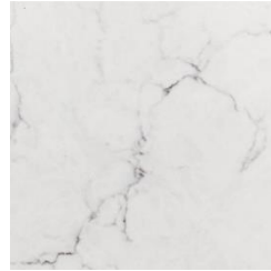
2CM BIANCO TIZA QUARTZ