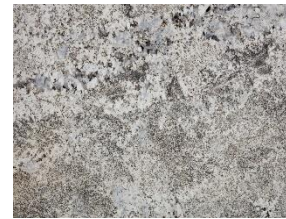
2CM SILVER FALLS GRANITE