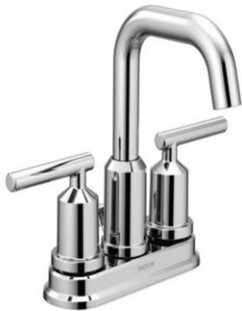
Bath Faucets Moen Gibson Chrome Two-Handle High Arc