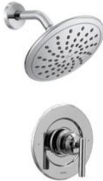
Owner's Bath And Next Gen (if applicable) Shower Valve Moen Gibson Chrome