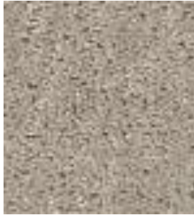
Carpet: LR001 Highflyer Color: 122 Sugar Cookie