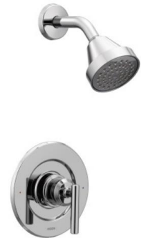
Secondary Shower (if applicable per plan) Moen Gibson Chrome