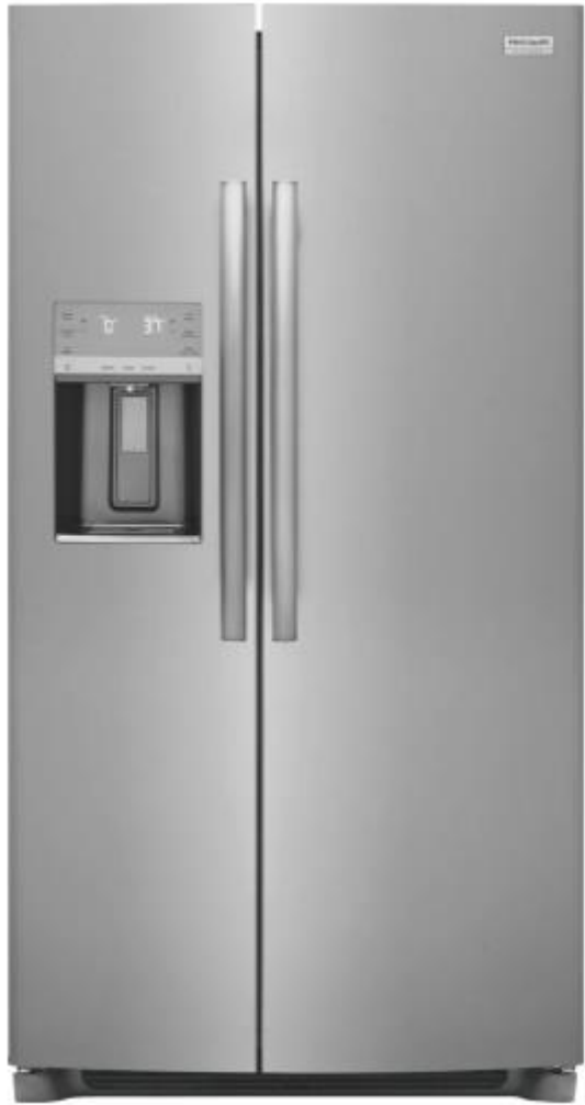
Frigidaire Gallery 25.6 Cu. Ft. 36" Standard Depth Side by Side Refrigerator