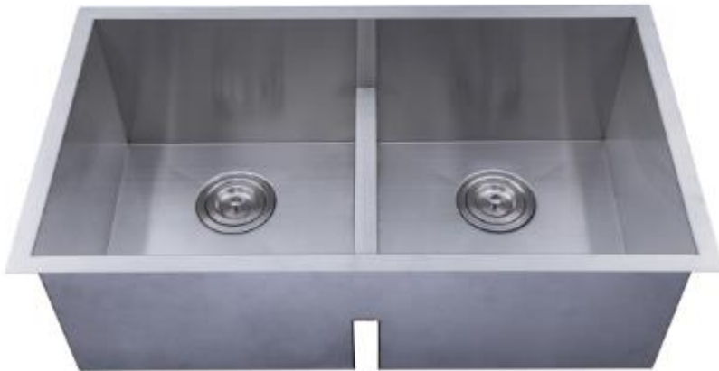
Stainless Steel Undermount Double Bowl with low divide