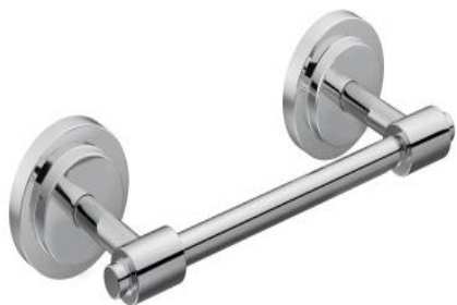
Moen ISO Chrome Pivoting Paper Holder