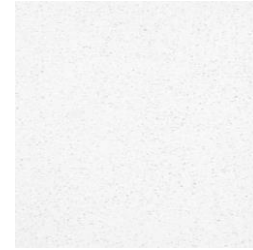
2 CM WHITE SAND-N QUARTZ