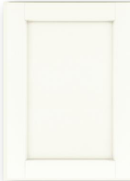
Barnett Duraform Linen