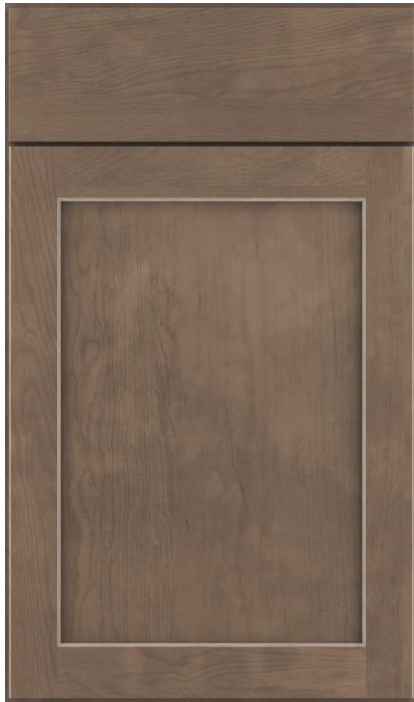
Sonoma Maple Latte