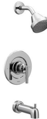
Tub/Shower Combo Faucet Moen Gibson Chrome