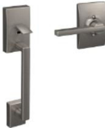
Schlage Century Handle Set Finish: Satin Nickel Entry Door