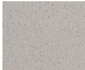
2CM ZINC QUARTZ