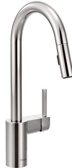
Moen Chrome One-Handle Align #7565