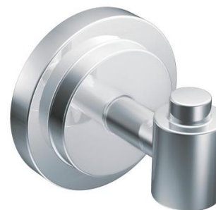
Moen ISO Chrome Single Robe Hook