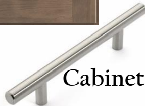
Cabinet Hardware - T-Bar Pull Polished Chrome