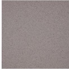
2CM CREST QUARTZ