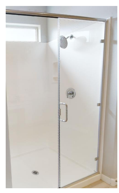
7' Cultured Marble Surrounds With Fiberglass Pan and Swing Door Shower Enclosure (Note: some plans do not include a window)