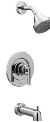
Tub/Shower Combo Faucet Moen Gibson Chrome T2903EP