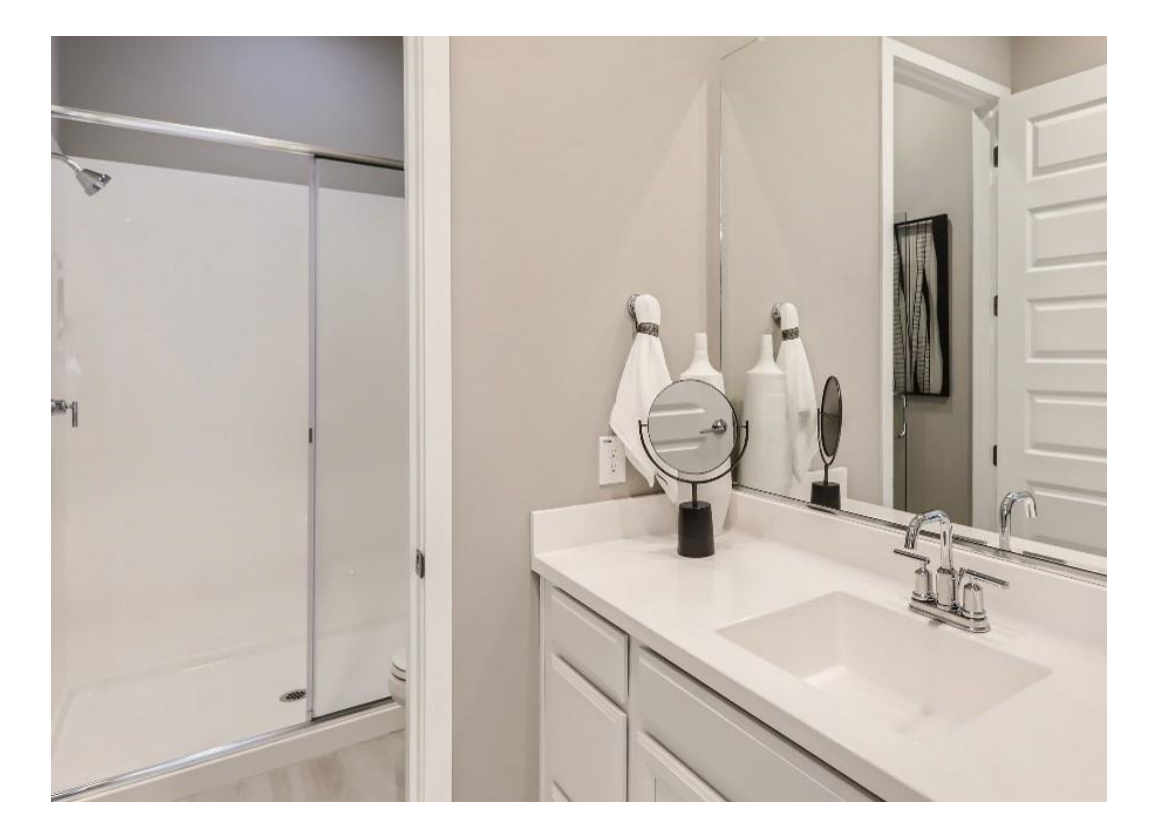
Plan 4578 7' Cultured Marble Surrounds with Fiberglass Pan With Chrome bypass door – 70" Height