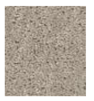
Carpet: LR001 Highflyer Color: 122 Sugar Cookie

Tile: Pinnelas Park 17x17 ceramic Color: 0100 Solace