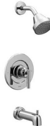
Tub/Shower Combo Faucet Moen Gibson Chrome T2903EP