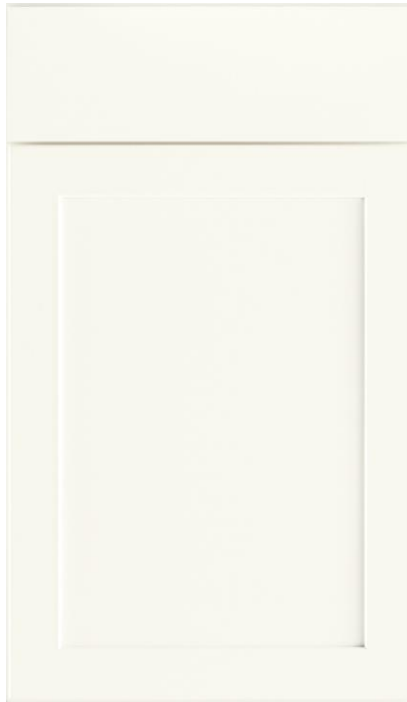
Sonoma Maple Linen