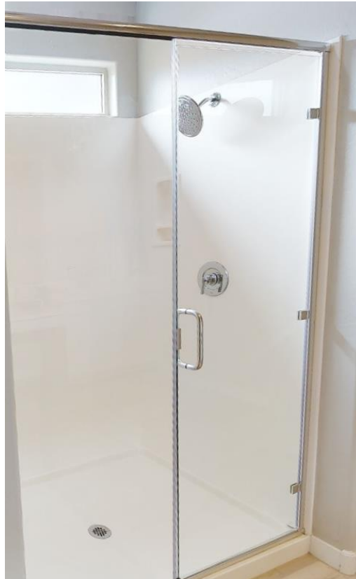
7' Cultured Marble Surrounds With Fiberglass Pan (note: some plans do not include a window)

AVION 45's - Arbors Sterling Quartz Plus