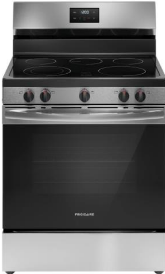
Frigidaire Range 30" Electric Range Stainless