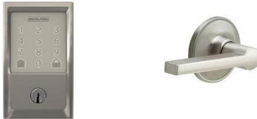
Schlage Encode Smart Wifi Deadbolt with Schlage Solstice Lever Finish