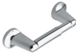
Moen Aspen Chrome Toilet Paper Holder