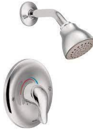
Owner's Shower Valve Moen Chateau TL182EP Chrome