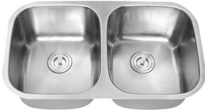
Stainless Steel Undermount Double Bowl with high divide