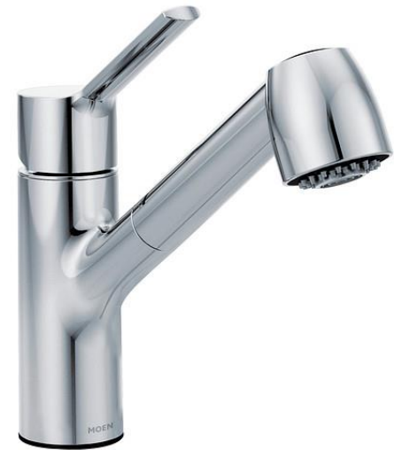
Moen Method Chrome