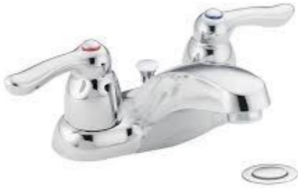
All Faucets Moen Chateau Chrome 64925 Two-Handle