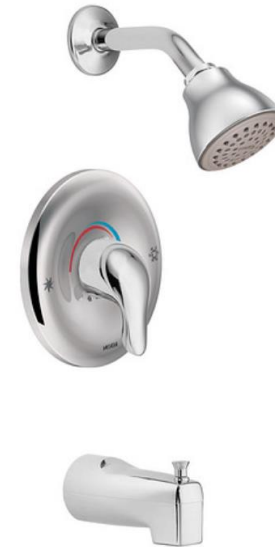
Secondary bath and Shower Valve Moen Chateau TL183EP Chrome