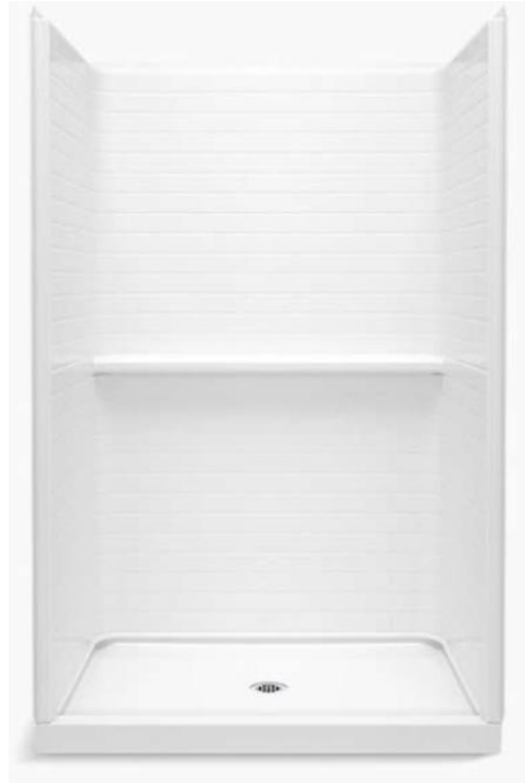
Sterling Traverse Vikrell Enclosure with tile surround look w/shower rod