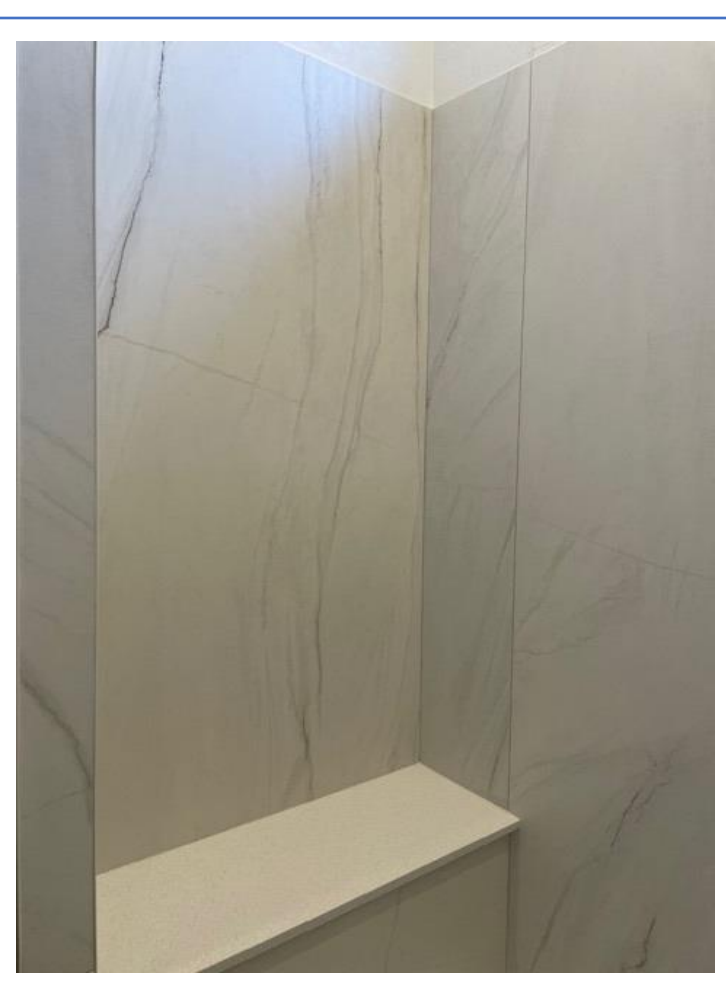
Porcelain Panels in Owner's Suite Shower Seat not applicable on all plans