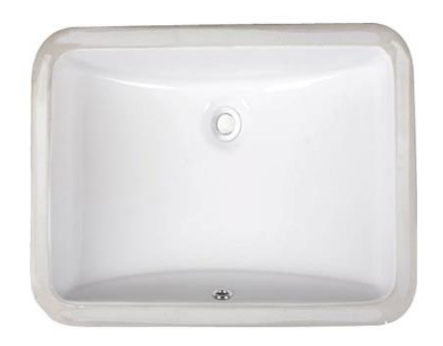
Bathroom Sinks with Upgrade Package