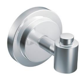
Moen ISO Chrome Single Robe Hook