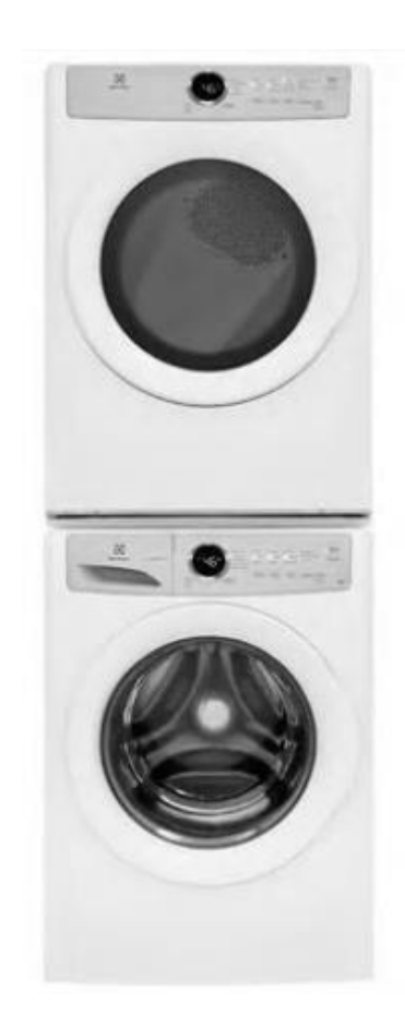
Stackable Washer/Dryer in NextGen Suite