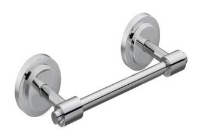
Moen ISO Chrome Pivoting Paper Holder