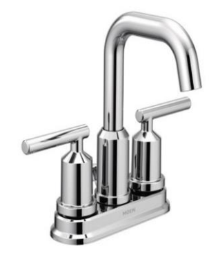
Bath Faucets Moen Gibson Chrome Two-Handle High Arc