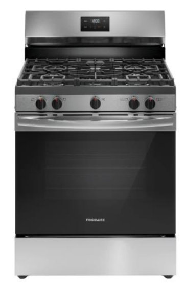
Frigidaire 30" Range Stainless Steel