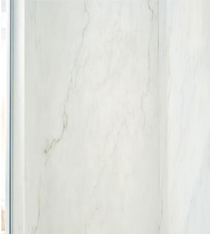
Owner Shower 7' Tall Porcelain Panel Surrounds