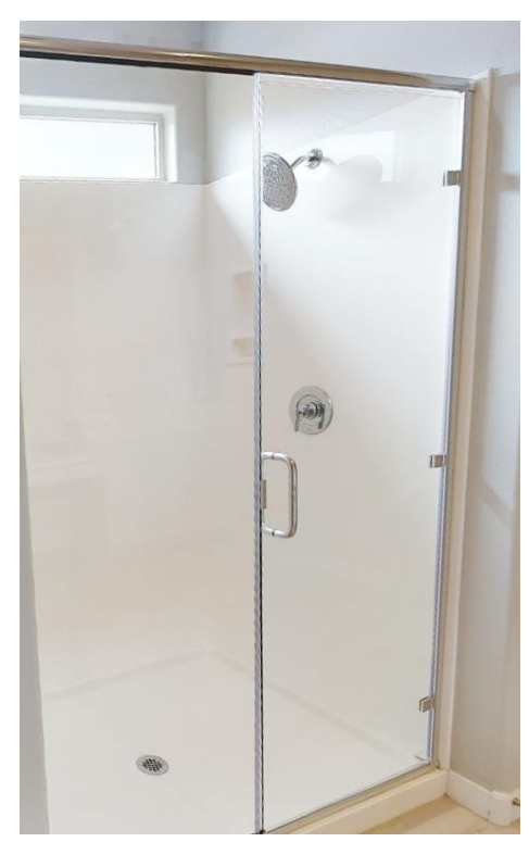
7' Cultured Marble Surrounds With Fiberglass Pan and Swing Door Shower Enclosure (Note: some plans do not include a window)