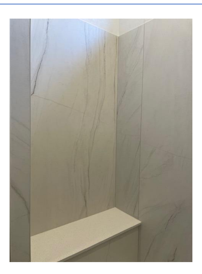
Porcelain Panel Surrounds in Owner's Shower & NextGen Suite Shower Note: Shower seat per plan, not included in all plans.