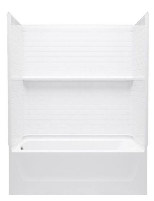
Sterling Traverse Vikrell Enclosure with tile surround look With Shower Rod