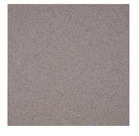
2CM CREST QUARTZ